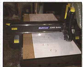
Computerized Router for Exact Dimensions