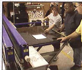
Electronic Thermoplastic Bender