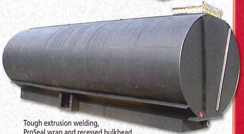
Tough extrusion welding, ProSeal wrap and recessed bulkhead

TANKS BUILT AND DELIVERED WITH PRIDE, THE PRO CUSTOMER WAY!