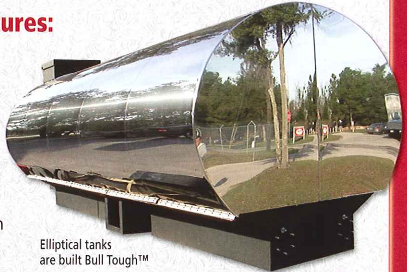
Elliptical tanks are built Bull Tough™