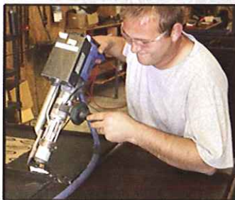
Electronically Controlled Fusion Welding

TANKS BUILT AND DELIVERED WITH PRIDE, THE PRO CUSTOMER WAY!